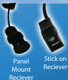
Panel Mount Receiver