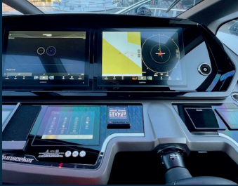
CONSOLE DASH PANELS