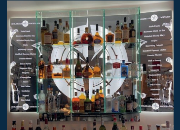
BAR LIGHTING / SHELVING