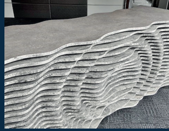
BESPOKE FURNITURE MANUFACTURE