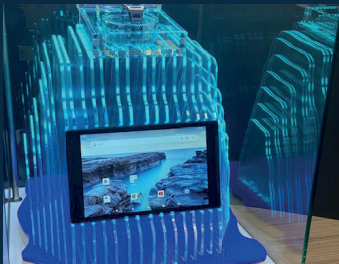
DISPLAY / SHOW PIECES