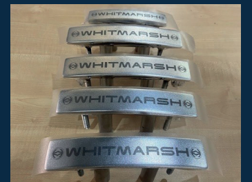
LASER ETCHED CLEATS

How to order: Simply email your enquiry to enquiries@dolphin-marine.co.uk