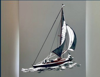
ILLUMINATED UNIQUE PICTURES