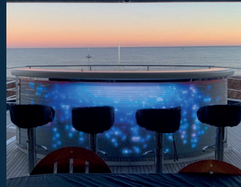
ILLUMINATED BAR FRONTS AND TOPS