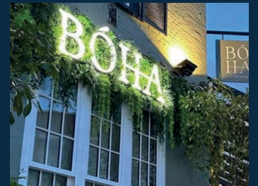
BAR / HOTEL / RESTAURANT SIGNAGE