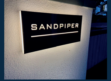
HOUSE PLAQUES / ILLUMINATED