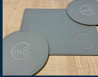
RUBBER ENGRAVING / CUTTING