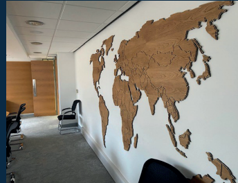
BESPOKE BOARDROOM DISPLAYS