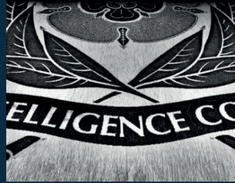
LASER WOOD ETCHING DESIGNS