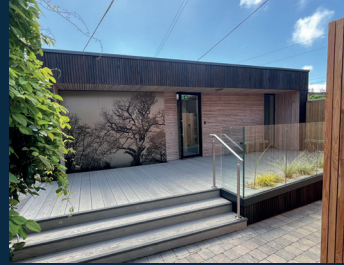
LASER METAL ETCHING DESIGNS