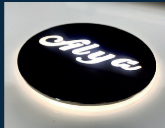
STEP LIGHTS MADE TO ORDER